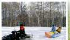
Snow Bananas Boat